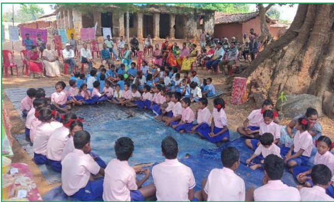
Sowing seeds for the future – education of children in the remote areas of Torpa, Jharkhand