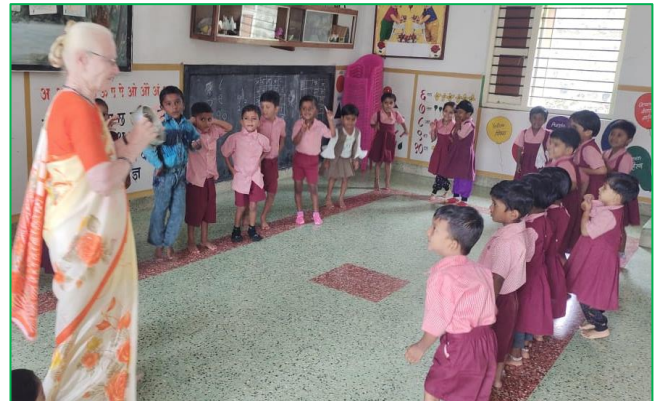
A teacher with a physical disability educating rural children -Haregaon, Dt. Ahmednagar