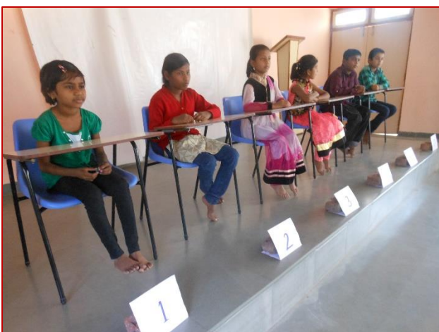
A General Knowledge Quiz Competition to prepare children from zilla parishad schools in the villages of Rahuri and Shrirampur Taluka in Ahmednagar Dt. To face competitive exams later