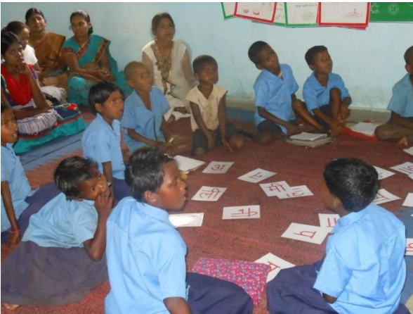
Remedial classes in the villages of Torpa, Jharkhand

Improving the standard of education in the rural areas is our commitment to reduce the inequality between the rural and urban youth