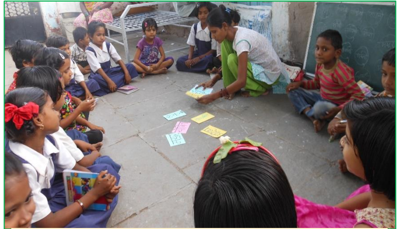
Remedial classes in the villages of Bhokar, Ahmednagar Dt.