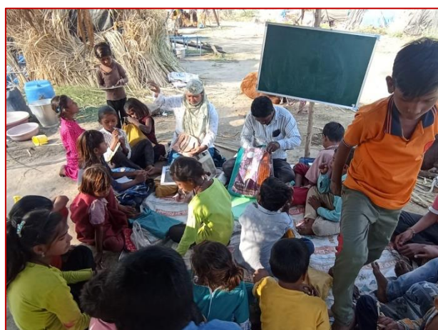
Literacy classes for the children of sugarcane cutters to help in their education- Dt. Ahmednagar