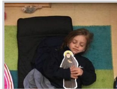
A student at the Rosary embracing Flat Philippine.